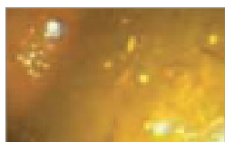
Unclean bowels = poor visibility

After the bowels have been cleansed successfully, they are as clean as in the image on the left.